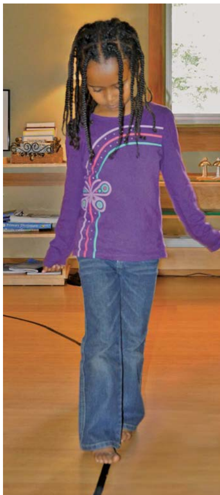
Fig. 3. Walking meditation in Montessori can be simply walking on a line (which required focused attention and concentration for young children) or walking on it without spilling water in a spoon or without letting your bell ring.

Montessori (36) curriculum does not mention EFs, but what Montessorians mean by “normal-