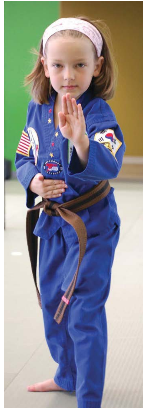
Fig. 2. A child demonstrating a tae-kwon-do stance.

Martial arts and mindfulness practices. Traditional martial arts emphasize self-control, discipline (inhibitory control), and character development. Children getting traditional tae-kwon-do training (Fig. 2) were found to show greater gains than children in standard physical education on all dimensions of EFs studied [e.g., cognitive (distractible-focused) and affective (quitting-persevering)] (28). This generalized to multiple contexts and was found on multiple measures. They also improved more on mental math (which requires working memory). Gains were greatest for the oldest children (grades 4 and 5), least for the youngest [kindergarten (K) and grade 1], and greater for boys than girls. This was found in a study where children 5 to 11 years old were randomly assigned by homeroom class to tae-kwon-do (with challenge incrementing) or standard physical education. Besides including physical exercise, martial-arts sessions began with three questions emphasizing self-monitoring and planning: Where am I (i.e., focus on the present moment)? What am I doing? What should I be doing? The later two questions directed children to select specific